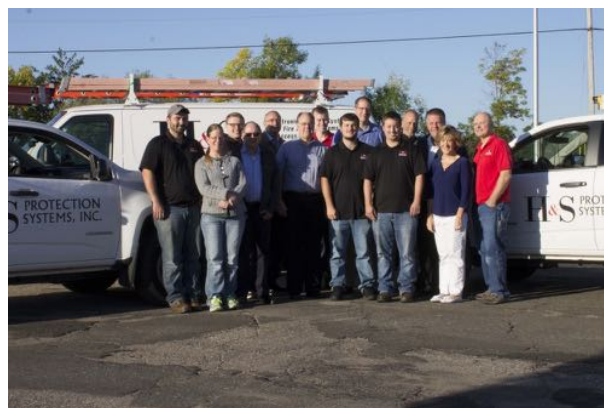
H&S ~ Stevens Point