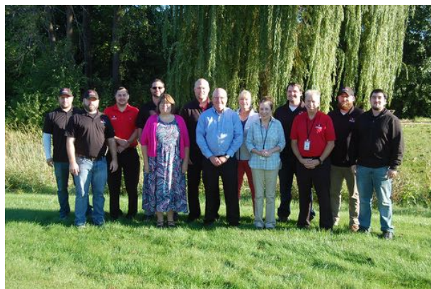
H&S ~ Pewaukee

Every customer is approached in this way – digging into the uniqueness of their business needs – to determine the best tailored security approach. H&S works closely with its technology partners, like Alarm.com, to make this happen.